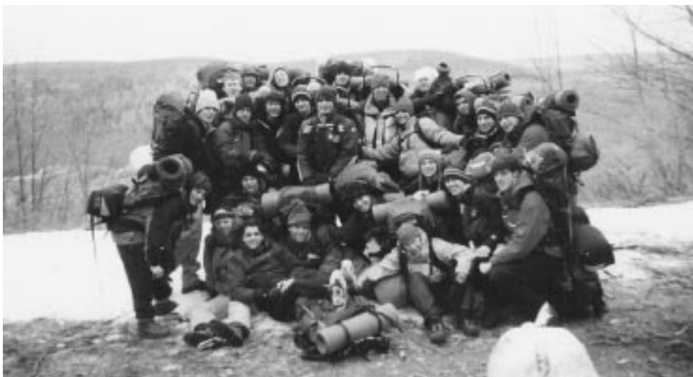
The pledge class shot after the long trek of Omega Chi.