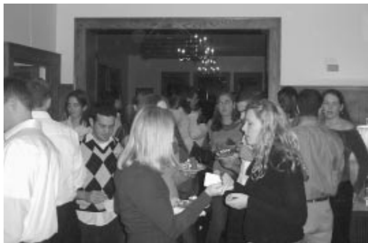
The Acoustic Café philanthropy event in December 2003 raised $1,300 for our favorite charity, the Children's Brittle Bone Foundation.